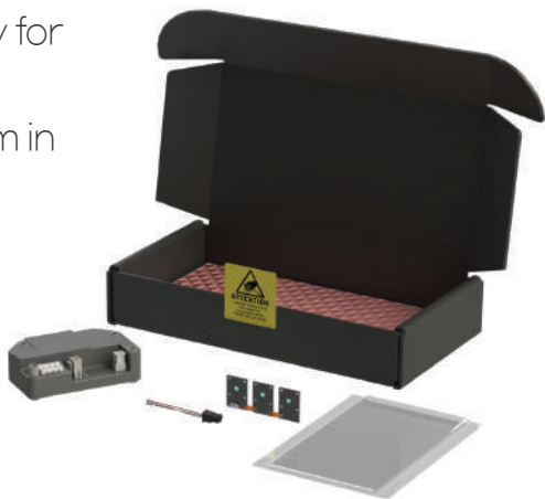
SPARE PART KIT