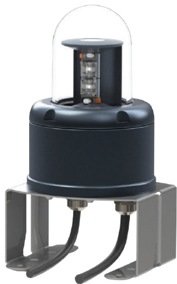
DHR80N POLAR (-55°C to 55°C)